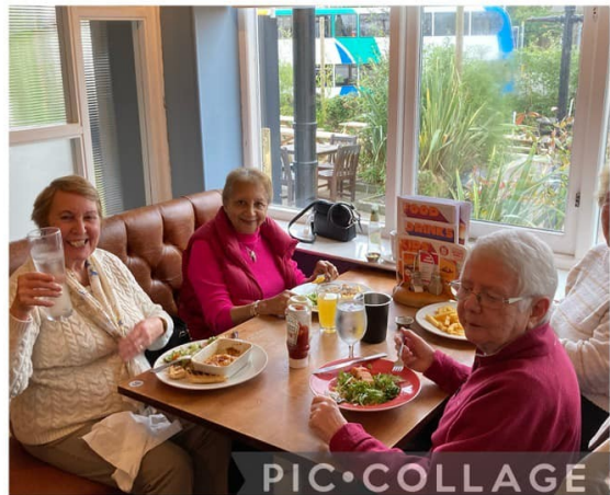
Lunch group at The Arrowe Park Hotel