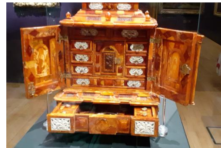
Right: Amber cabinet with intricate carvings and ivory insets.